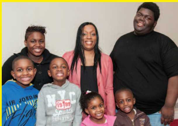
The Ware Family IHN Guests